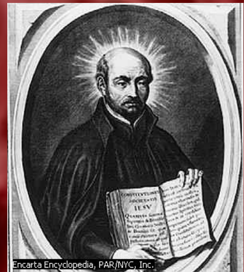
Encarta Encyclopedia, PAR/NYC, Inc.