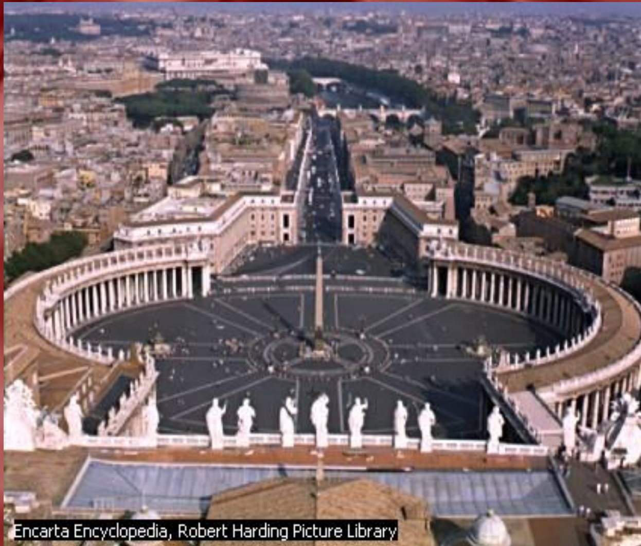
Vatican City (St. Peter's Square and Basilica). 10