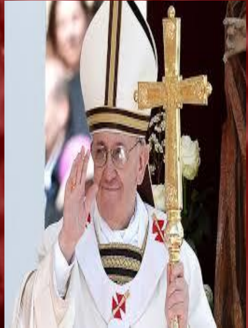
Triple Crown of the popes and Pope Francis I.