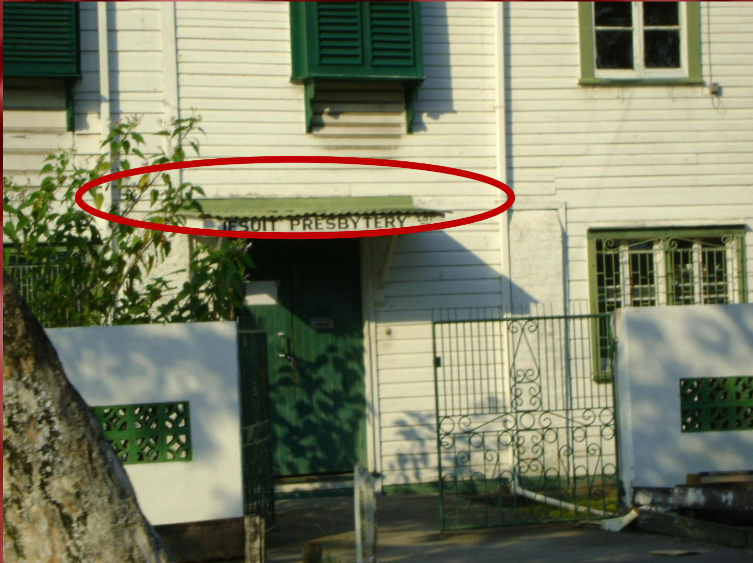
A Jesuit Presbytery in Guyana.