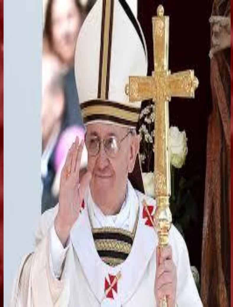
Triple Crown of the popes and Pope Francis I.