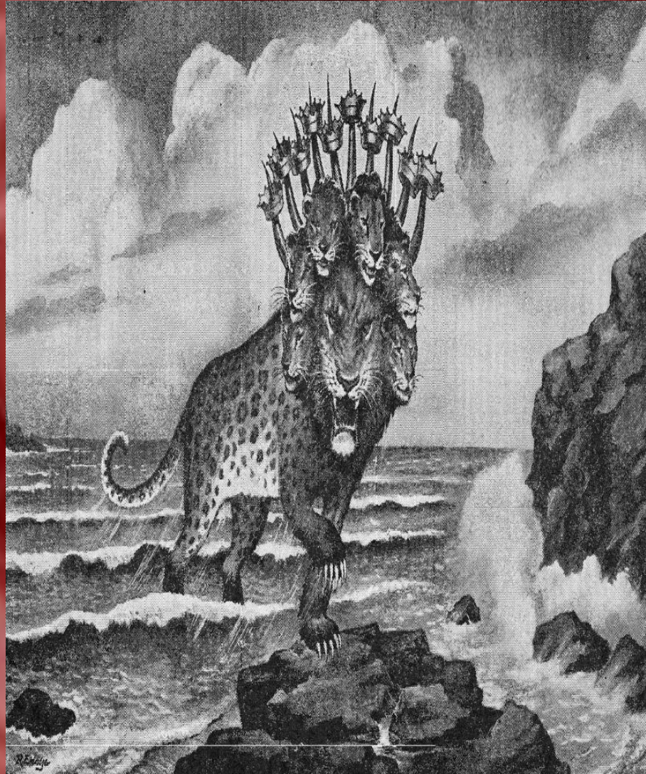
The Composite Beast of Revelation 13.