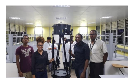
UGAS Executives 2018/2019