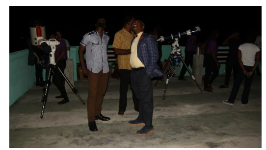
Glow Hotel Kitty – November 11, 2018.