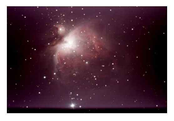
Orion's Nebula – August 8, 2019.