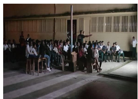
Patentia Secondary – March 6, 2019.