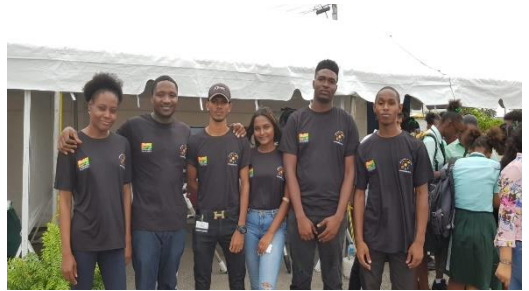
Turkeyen Campus – February 15, 2019.