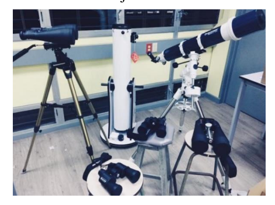
Faculty of Natural Sciences Orientation

George Walcott Lecture Theatre Monday August 26, 2019