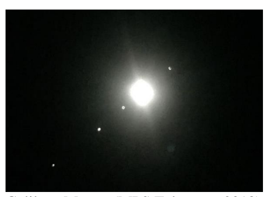
Galilean Moons (MPS Telescope 2018)